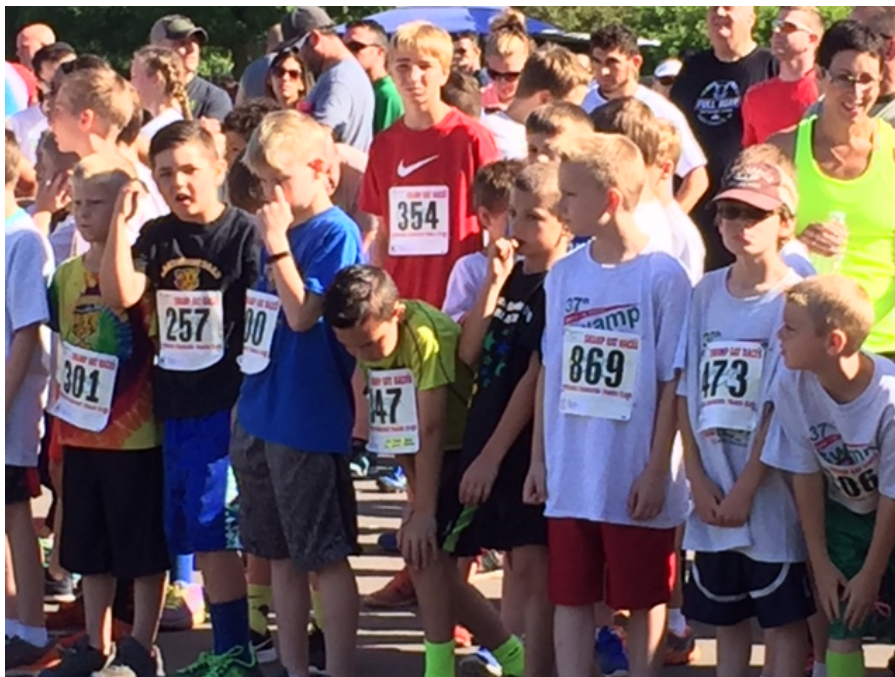
At the start line of the 'mostly' boys 1 mile