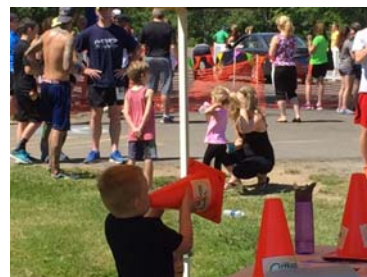
Youngster practicing his announcing